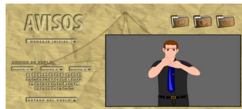
Figure 4. Playing a video obtained from submenus

When selecting the screen shown in Figure 2, the button located on the bottom of the main menu, sends us to the scene menu notices shown in Figure 4, where you can select messages with information regarding to flight status. In this section we find eight buttons, five of which have special behavior, because they contain submenus.