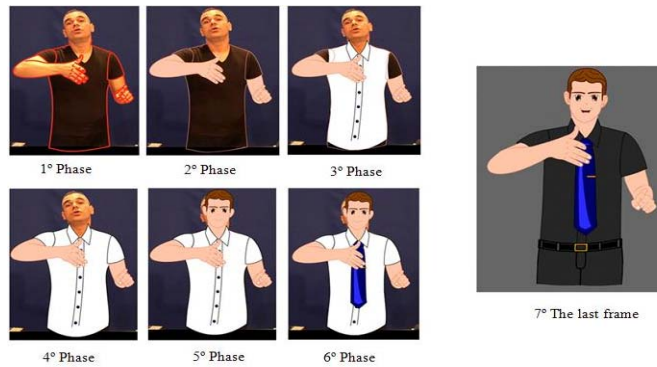
Figure 1. Changes in a single frame, during the animation process

The results obtained to the first application are shown in Figures 2, 3 and 4. Figure 2 shows the first screen for the main menu, which the user finds when accessing this application. There, has been inserted a background image composed of a scenario that is acquainted with the airport environment. For its composition, it was used the characters and the logo, taken from a photograph taken outside the enclosure, plus the addition of two buttons with the name of their function, which when clicked allows access to the submenu.