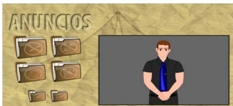
Figure 3. Playing a video advertisements menu