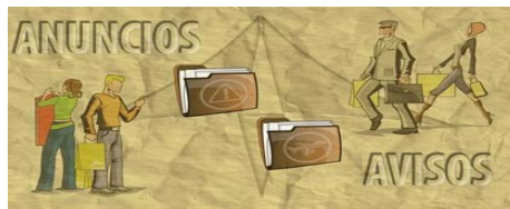
Figure 2. Display MAIN

When the folder shaped button on the top with an icon showing an exclamation mark is pressed, it redirects us to the scene of the advertisement menu, shown in Figure 3.1, where you can choose one of the four videos available by pressing the corresponding button. In this section we find six buttons, four for displaying the advertisements and two smaller ones, of which one has the function to move the scene of notices and the other one returns us to the main screen.